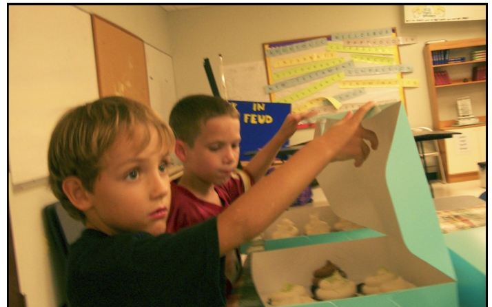
Parties start with cupcakes!

Our programs to help homeless families achieve permanent housing, self-sufficiency, and financial stability are holistic and include the children. We currently have 47 children, ages 18 months to 14 years, in our programs. Highlights in our children's program are explained below.