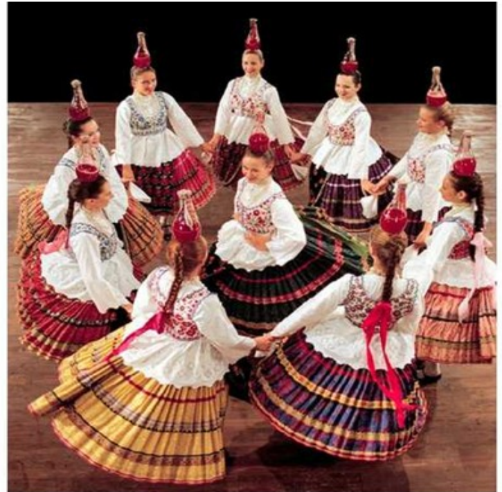
The Hungarian State Ensemble performs in this undated, provided photo.

Donations can be dropped off at our office between 9:30 am and 4:00 pm. We suggest you call first, so we can make sure a member of our staff is available to receive the goods.