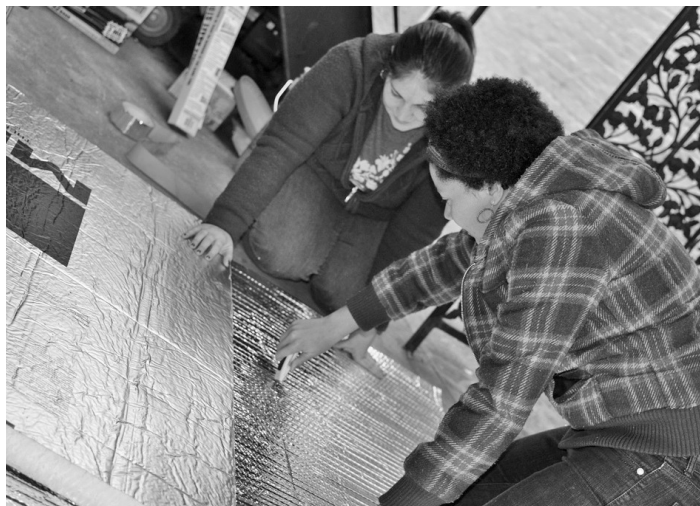
Volunteers from the Chesapeake Conservation Corps spend a day weatherizing eight Advocates properties.